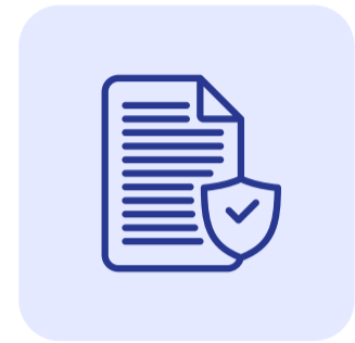
Monthly Vulnerability Assessments