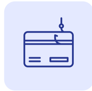
Phishing Simulation & Security Awareness Training