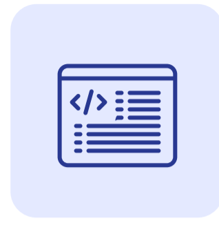
Web Application Testing