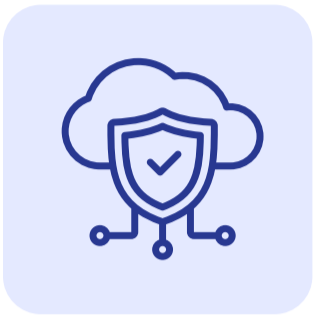
Cloud Security Testing