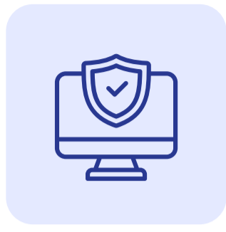
Internal Network Penetration Testing