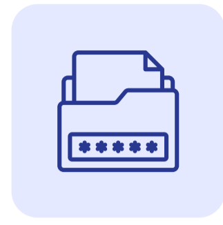
API Security Testing