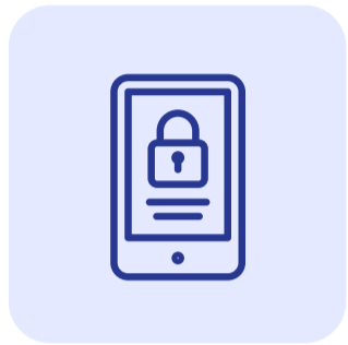
Mobile Application Testing