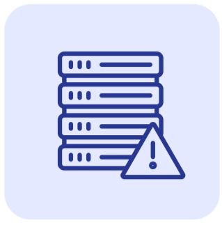
External Network Penetration Testing